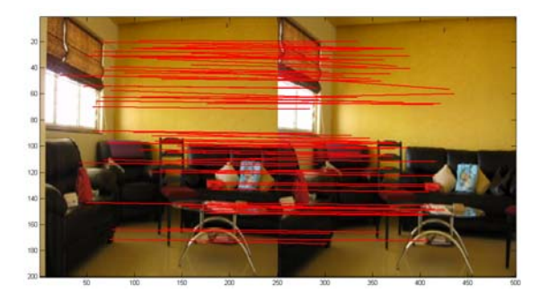
Fig.4: Features detected by Scale Invariant Feature Transform (SIFT) and matched by using nearest neighbor algorithm

Red lines show the corresponding matching feature pairs between the successive images.